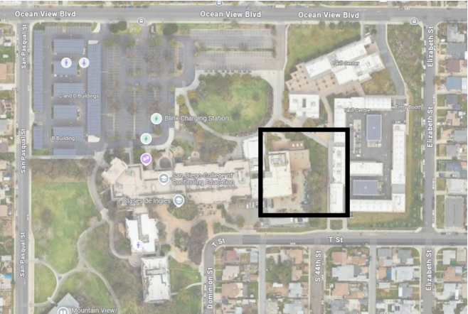
4343 Ocean View Blvd, San Diego, CA 92113