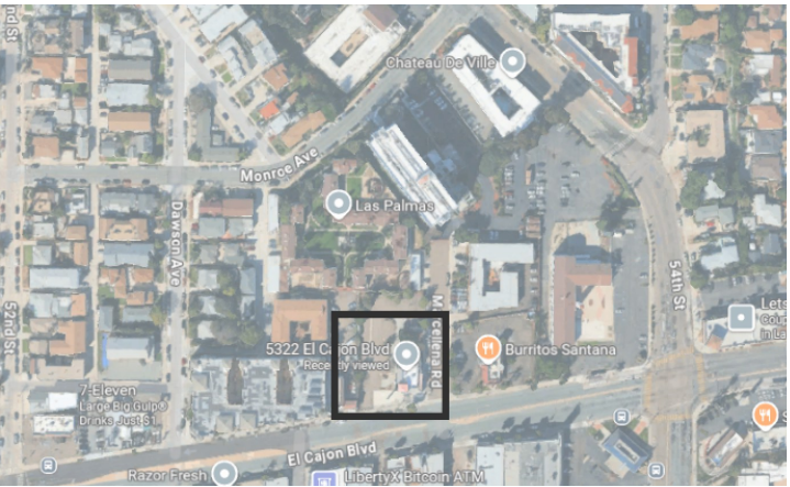
5322 El Cajon Blvd, San Diego, CA 92115

Additional resources, articles, and links related to this project will appear here when available. For comprehensive information about Measure HH and all ongoing projects, please explore the Measure HH website .