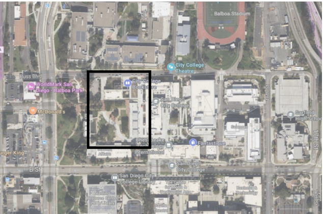
1313 Park Blvd, San Diego, CA 92101