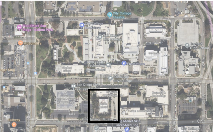
1313 Park Blvd, San Diego, CA 92101

The San Diego City College Saville Theatre Replacement project includes the abatement and demolition and removal of the existing Saville Theatre, as well as the removal and replacement of associated site utilities and appurtenances in alignment with the campus’s Master Plan. New construction of approximately 20,000 assignable square feet (ASF) includes: Street-level lobby with Box Office, restrooms and manager’s office Coordination with Building C façade Main theatre with 250-350 seats Stage, orchestra pit, control room and support spaces Scene shop, costume shop Rehearsal rooms, Recording/Editing and Dance Studios Future connection to Outdoor Amphitheatre Sustainable landscaping and irrigation New walkways and accessible path of travel to compliant parking areas Exterior and interior signage